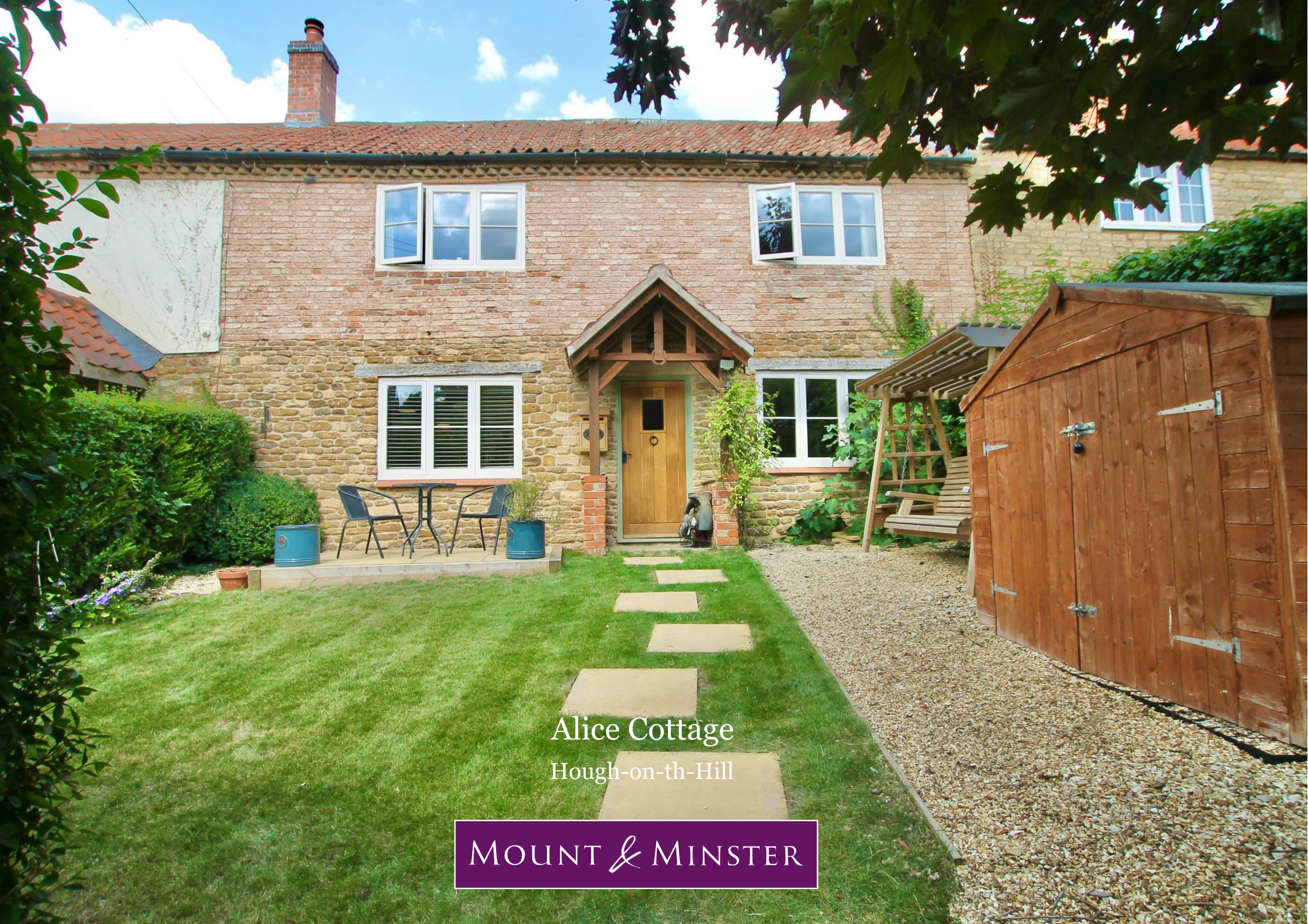
Alice Cottage Hough-on-th-Hill